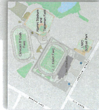
This area is across the Fox River from the main campus